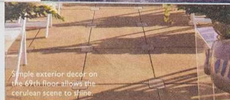
Simple exterior decor on the 69th floor allows the cerulean scene to shine.

terraces spread across more than 13,000 square feet of white marble and gold interior and minimalist exterior spaces, and holds up to 800 standing total and 200 seated per floor. Ride high! oue-skyspace.com